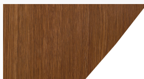
HONEY OAK SUPER MATT / WHITE PVC