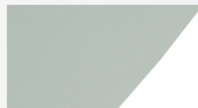
AGATE GREY / WHITE PVC