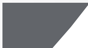
BASALT GREY / WHITE PVC