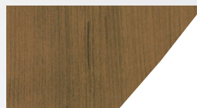
RUSTIC CHERRY / WHITE PVC