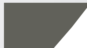
QUARTZ GREY / WHITE PVC