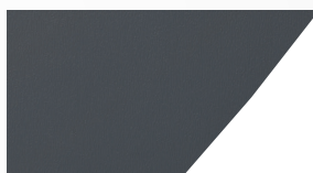
SLATE GREY / WHITE PVC