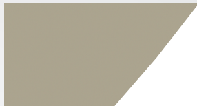
SAGE SMOOTH MATT / WHITE PVC