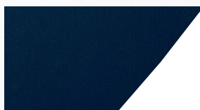
BLUE STEEL / WHITE PVC