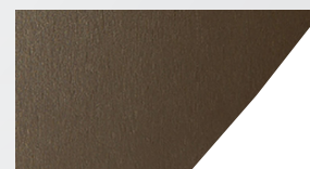
BRONZE METALLIC / WHITE PVC