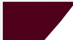
VIN ROUGE / WHITE PVC