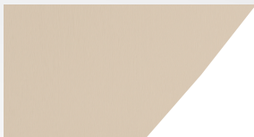
CLAYSTONE / WHITE PVC