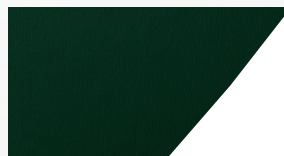
FIR GREEN / WHITE PVC