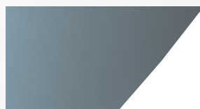
SILVER BULLIT / WHITE PVC