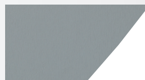
GREY / WHITE PVC