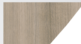
CEDAR GREY / WHITE PVC