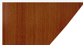
SOFT CHERRY / WHITE PVC