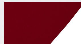
DARK RED / WHITE PVC